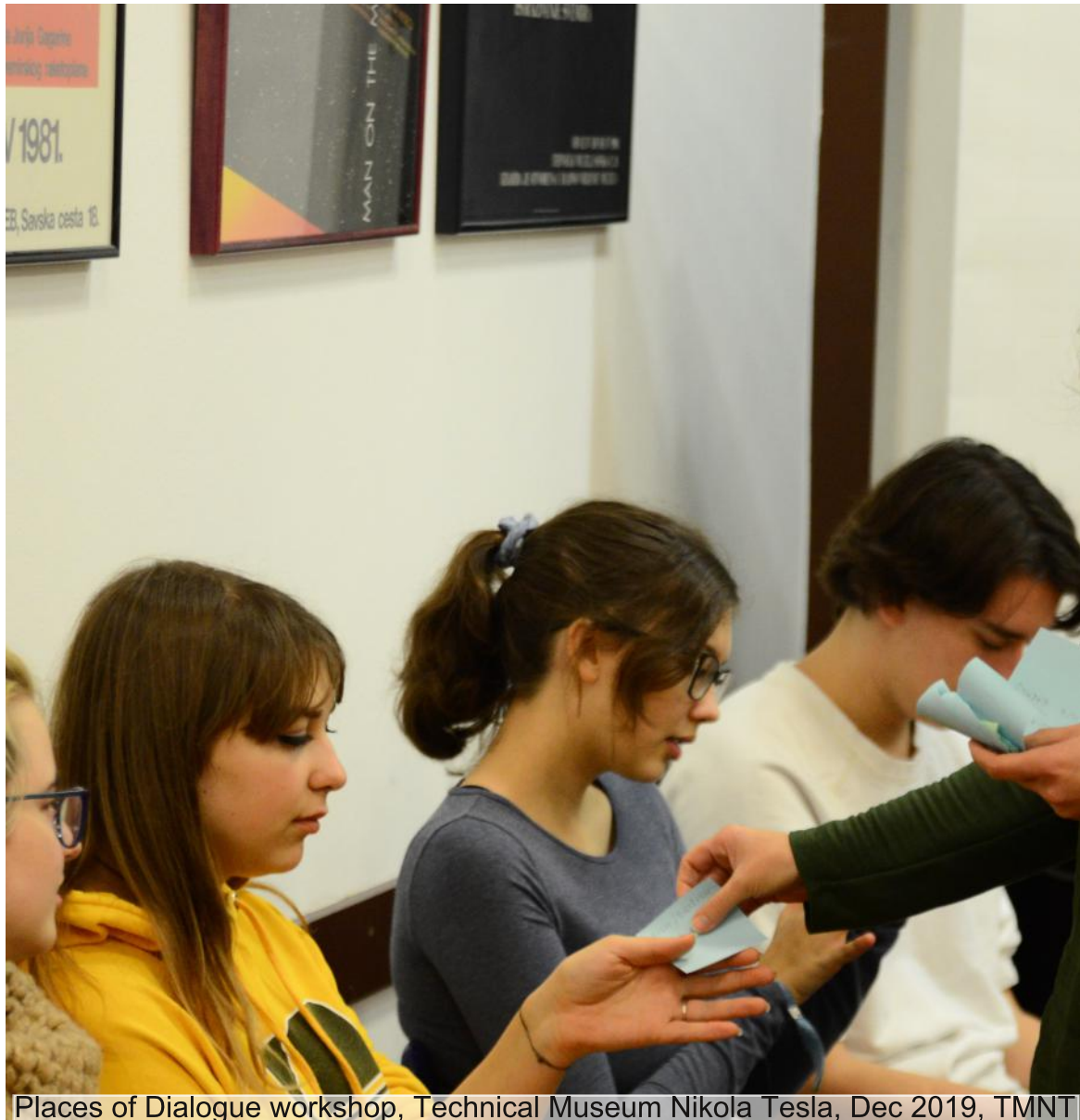
Places of Dialogue workshop, Technical Museum Nikola Tesla, Dec 2019, TMNT