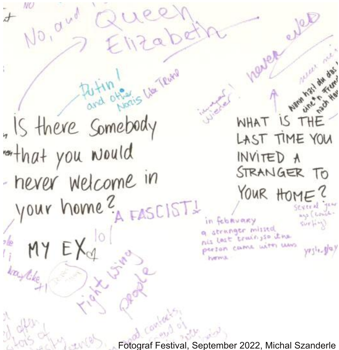
Fotograf Festival, September 2022, Michal Szanderle